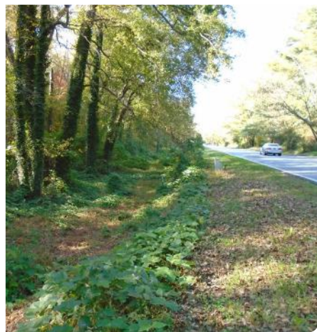
This segment of future trail along Vanderbilt Road will follow a tributary of the Fairforest Creek along the existing sewer right of way.