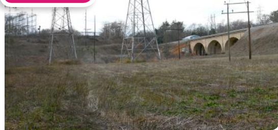
This segment will follow the Duke Energy property and pass under the Norfolk Southern bridge.